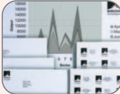
Superb quality printing on a wide range of paper types, transparencies and envelopes