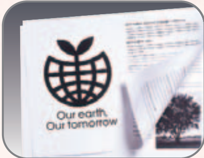
Paper saving double-sided printing