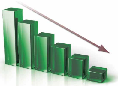
Minimise your power consumption: less than 6.5 W in energy saver mode.