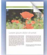
'Level Color™' print