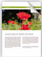
Normal colour print